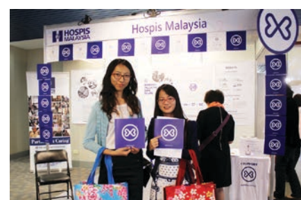
HM hosted a booth at the conference aimed at promoting its annual palliative care-themed workshops and furthering awareness for the palliative care symbol