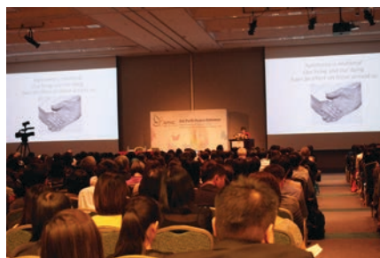
Prof. Baroness Illora Finlay addresses the conference theme in her plenary session

Professor Baroness Ilora Finlay of Landaff, Oncology and Palliative Medicine, Cardiff University (UK) talked about the different challenges faced in palliative care, which ranged from the sensitive topic of euthanasia and physician-assisted death, financial issues in policy making, to providing education and training in skills necessary for palliative care. Professor Baroness Finlay also stressed the importance of clinicians' behaviour. "The doctor's attitude influences the consultation and patients' thinking profoundly. Yet, validity of any decision requires that the patient has accurate unbiased information, the mental capacity to understand fully the implications of the decision and each decision must be free of coercion."