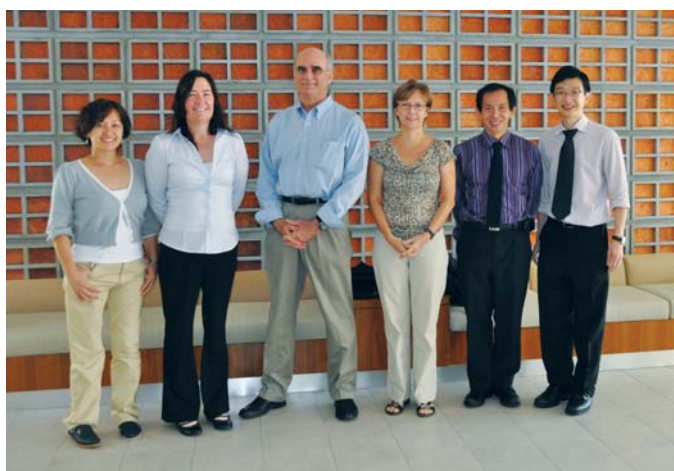
A visit from consultants from Altarum Institute to meet with the team working on the Decent Care Values Project

In August 2010, Hospis Malaysia together with the Altarum Institute from the United States were awarded a world demonstration research project by the World Health Organisation to look into a new form of healthcare work organisation called Decent Care Values.